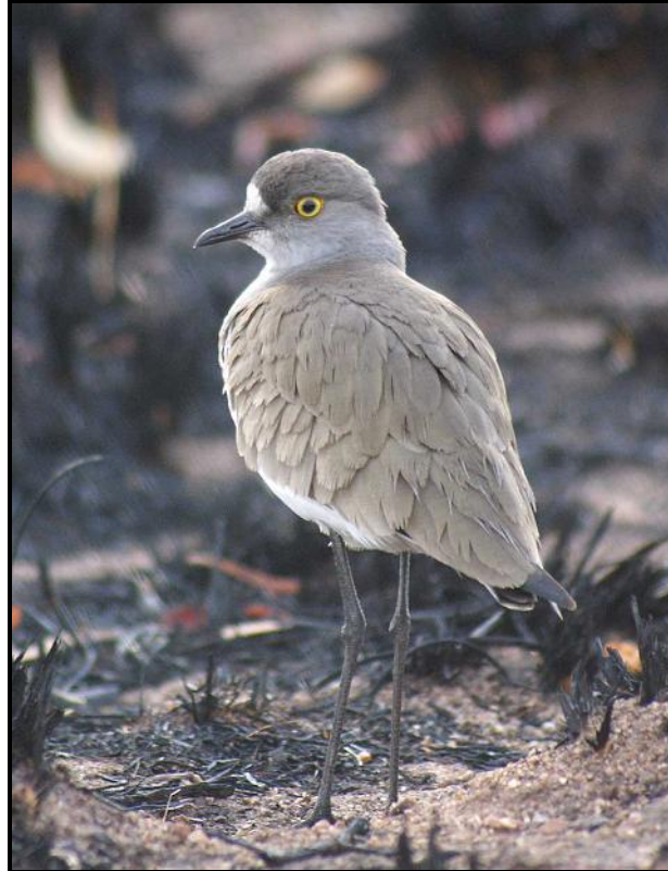
Above: Senegal Lapwing; Kruger National Park.