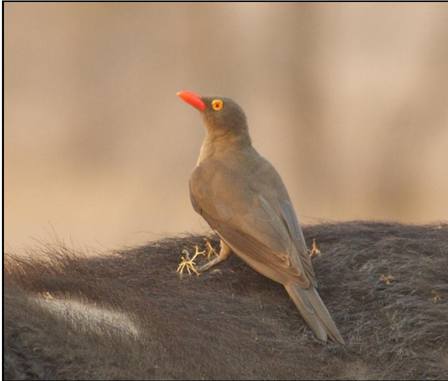
Above: Red-billed Oxpecker on a Cape Buffalo's back; Kruger National Park.